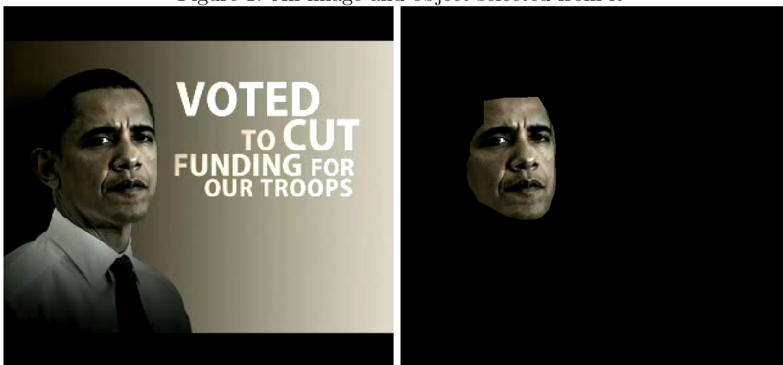
Figure 1: An image and object selected from it

When processing a large batch of images, users may find it more beneficial to go about creating these polygons in a corpus of images by utilizing the interface provided with Bio7 , a Windows and Linux development environment originally designed for ecological modeling, available at http://sourceforge.net/projects/bio7/ . Bio7 provides an excellent interface with which one can outline a polygon in an image and send the image's coordinates to R. With a little bit of scripting, a system can be set up to easily extract the coordinates