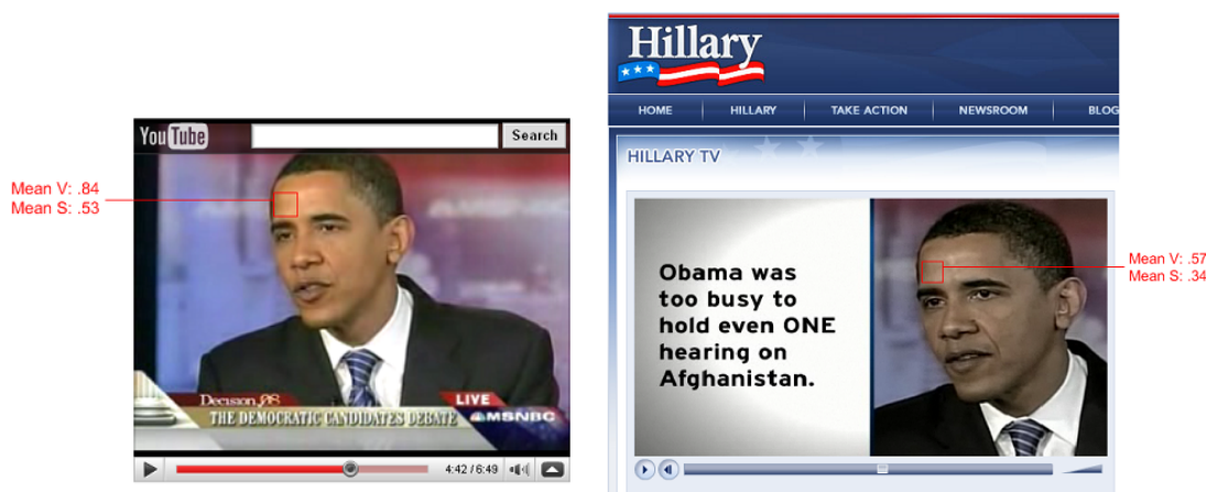
Figure 3: Video still capture from original MSNBC footage (via YouTube) and ad on Clinton campaign website

The images in Figure 3 above show video stills that I captured from the Clinton campaign website and the original MSNBC footage (from YouTube). The package includes the polygons that correspond to the facial coordinates of Obama's face in each image clintonpoly and msnbcpoly respectively, so we simply create a new image from those coordinates, make sure the polygon is capturing the correct portion of the image via the plot function, and generate saturation and value readings.